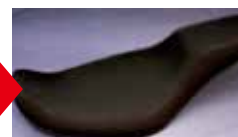
Seat assembly for two-wheeled vehicles