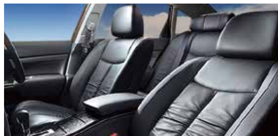
Seat covers for four-wheeled vehicles

Feel free to contact Tokai Trim if you have any inquiries or requests.